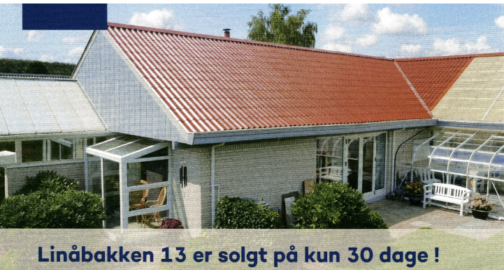
Linåbakken 13 er solgt på kun 30 dage !

We were fortunate to have our house sold to a very nice couple, Torben and Ulla, after just one month on the market.